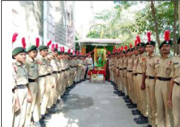
NCC Day celebration