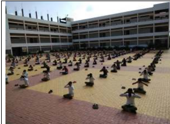
Cadets doing Yogasana