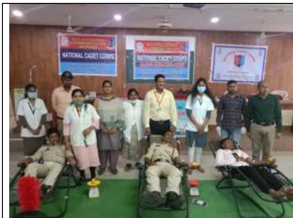
Cadets donating blood

The number of cadets participated-90 (Blood Bag collected-18)