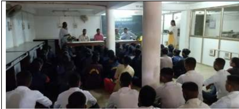
Human Rights day celebration