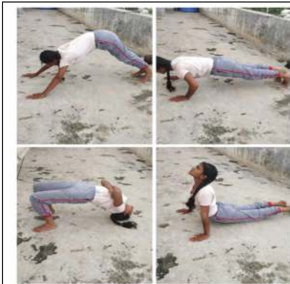
Cadets doing Yogasana

The NCC cadets celebrated International Yoga Day during the pandemic by practicing yoga at their homes. The celebration started with the practice of various yoga asanas, including Surya Namaskar, Bhujangasana, Vrikshasana, and others. The cadets were encouraged to practice these asanas regularly, as they help in reducing stress, improving concentration, and promoting physical and mental well-being. The number of cadet's participated-55