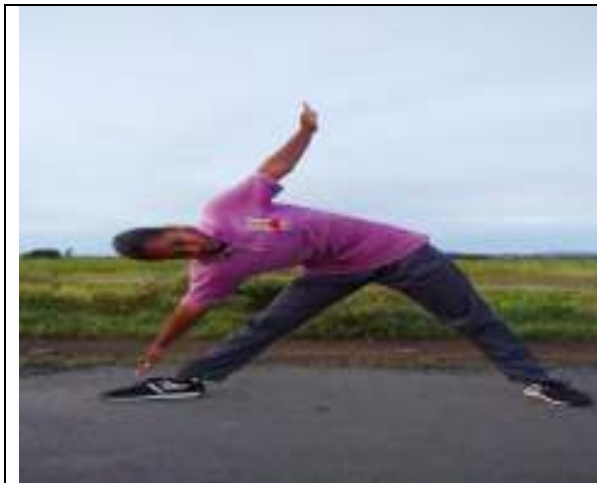
Cadets doing Yogasanas